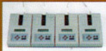
Asynchronous Volume Production Mode