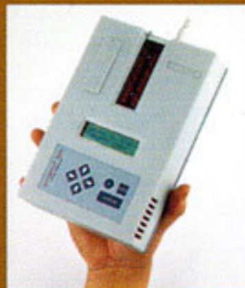
In Field Service